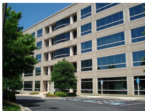
2520 Northwinds Pkwy / Two Northwinds Center