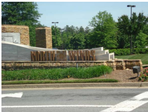
Entrance to Northwinds Center